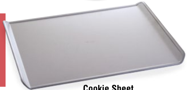
Cookie Sheet $23.25 value #RQ56