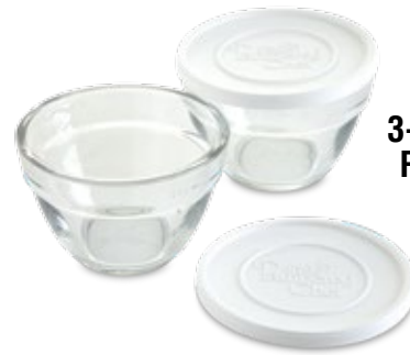
3-Cup (750-mL) Prep Bowl Set $24.25 value #RQ59