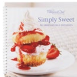
Simply Sweet cookbook $21 value #RQ60